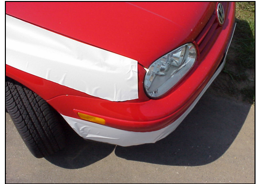
Automotive transit tape made from white ProMask film