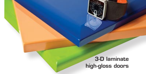
3-D laminate high-gloss doors

Because of fixed materials costs and processing times, flat and 3-D laminating for high-gloss effects is more cost-efficient than painting or lacquering, which can require additional coats