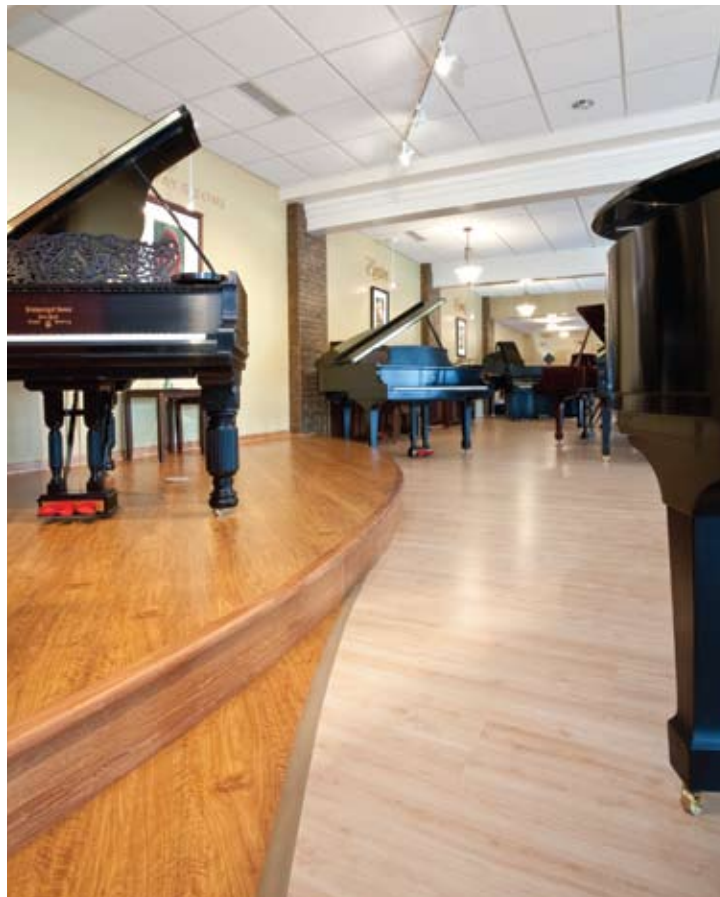
● HPL is used for the highest durability commercial laminate floors, and is often specified in retail stores, hair salons and medical clinics.

Materials in the “rare veneer” category are created by slicing thin layers from low-value trees, recombining them into multi-ply panels over undulating press plates and re-sliced, resulting in veneers that convincingly mimic high-character