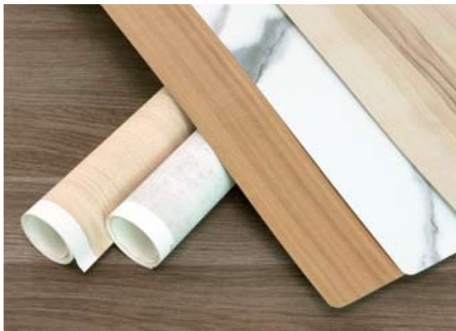
• The patterns and designs you see on HPL, TFM and paper foils are usually printed on décor papers in a rotogravure process. Printers track global trends and often derive their concepts from rare raw materials, delivering designs that are not otherwise commercially available.