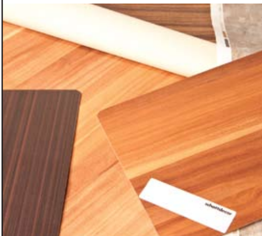
Samples of the printed papers that make up the decorative layer of HPL and TFM laminates.

Schattdecor's supply of fine and rare woodgrains have a guilt-free guarantee