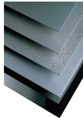
• Press plates impart texture to laminates during manufacturing to complement a printed design, or to add an extra dimension to a solid color.

be laid in the press at once for increased economy. As mentioned earlier, textured press plates may be used to control gloss levels, or impart textures that mimic stone, wood, tile, or other surface designs.