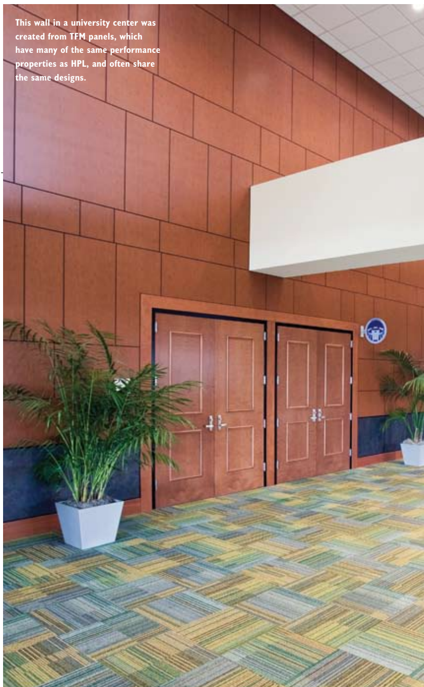
This wall in a university center was created from TFM panels, which have many of the same performance properties as HPL, and often share the same designs.

The true "value" of these products comes into play in a big way with matching materials programs. There was a time when every laminate supplier wanted you to specify their materials on every surface in your project. And to be fair, this was the only choice you had if you wanted