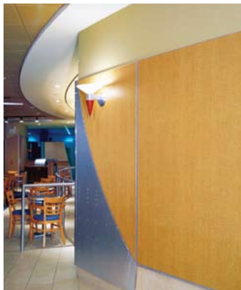
TFM panels offer superior durability, design consistency and value in commercial interiors and furniture.

Roseburg: North America's most diverse selection of decorative architectural panels