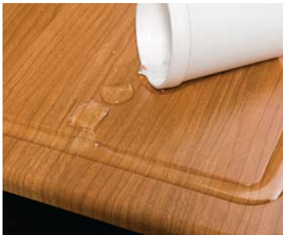
• Use of 3-D laminates is growing in medical interiors and other applications because of its ability to seal a panel on five of six sides, minimizing seams where bacteria collects. 3DL can also carry durable high-gloss finishes.