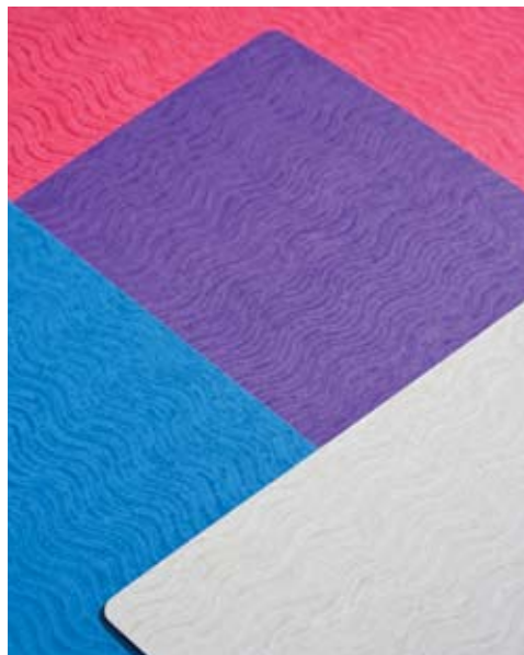
A sampling of Wilsonart's Go Wavy collection.

Wilsonart's new launch energizes design for health care, education and retail