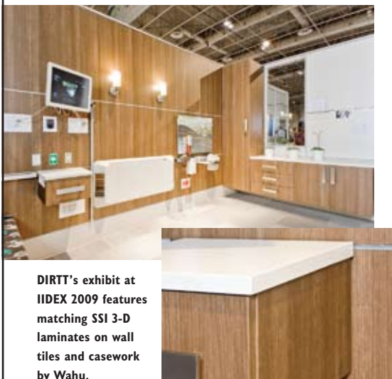
DIRTT's exhibit at IDEX 2009 features matching SSI 3-D laminates on wall tiles and casework by Wahu.

3-D laminates from SSI create high-performance designer walls and casework