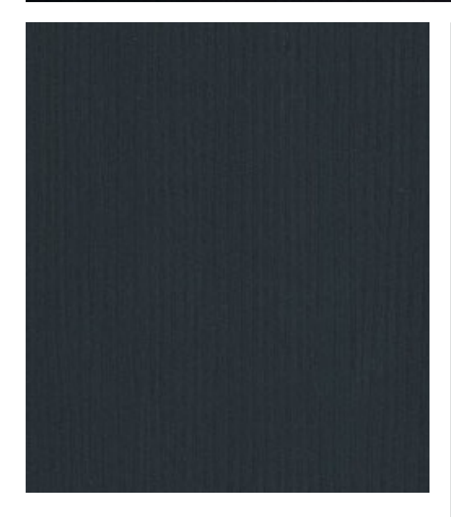
COMPLEMENTARY MATERIALS CLICK HERE